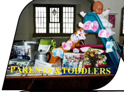
PARENTS & TODDLERS