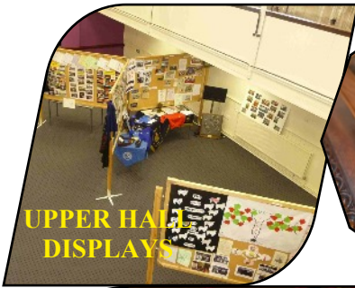
UPPER HALL DISPLAYS